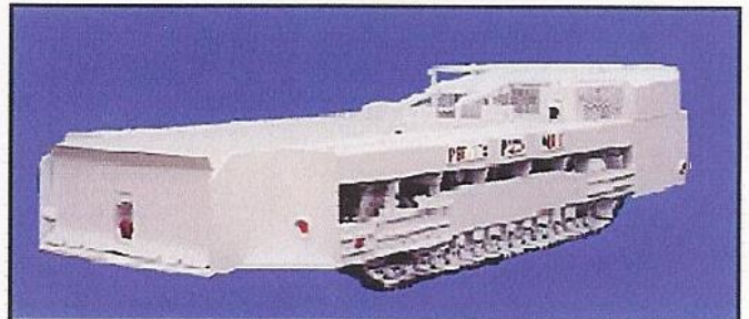
Fully extended Ram with Push Plate