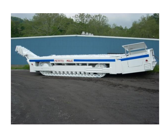
Protected by US and International Patents